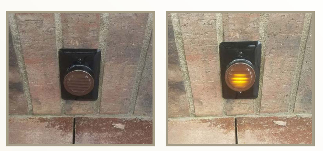
Shielded Lights that meet guidelines

At some point in everyone's life, there's a moment when they look up on a clear night and become captivated by a bright sky of countless stars. These wonderful moments usually occur in remote areas outside of cities or towns, where the night sky is brightest. A major reason that more stars are visible in isolated areas is there is typically less light pollution. In an effort to keep the stars shining bright on our beautiful lakes, we will discuss what light pollution is, how it can be reduced, and what our current policies are related to this issue.